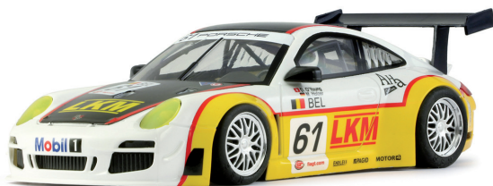
Porsche 997 Silverstone 2009 #61