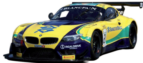
BMW Z4 Nogaro 2014 #21