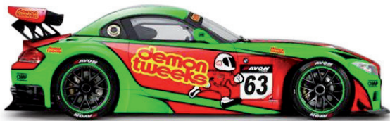
BMW Z4 Rockingham 2015 #63