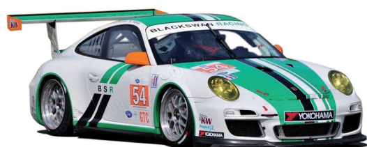
Porsche 997 Grand Prix Mosport 2011 #54