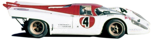
Porsche 917K Kyalami 1971 #4