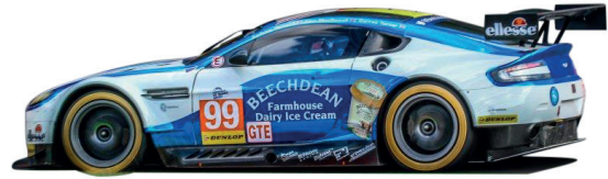
ASV GT3 24h Le Mans 2016 #99