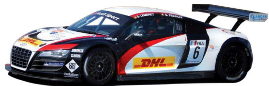
Audi R8 LMS Jarama 2010 #6