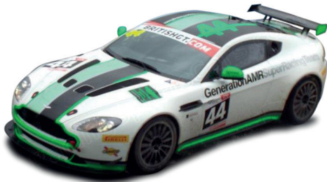
ASV GT3 Donington 2016 #44