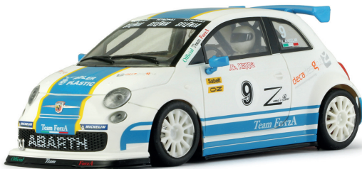
Abarth 500 Assetto Corsa Trofeo Selenia Mugello 2015 #9