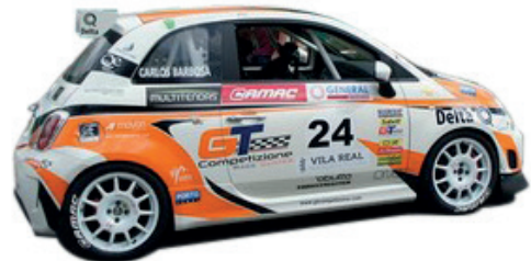
Abarth 500 Assetto Corsa Trofeo Abarth Portogallo 2014 #24