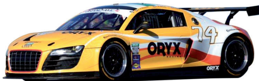
Audi R8 LMS Daytona 2016 #74